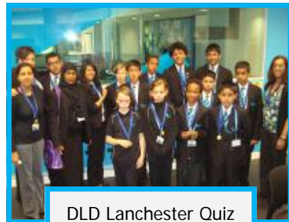
DLD Lanchester Quiz Winners L4